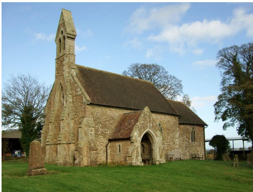
Holy Trinity, Wheathill