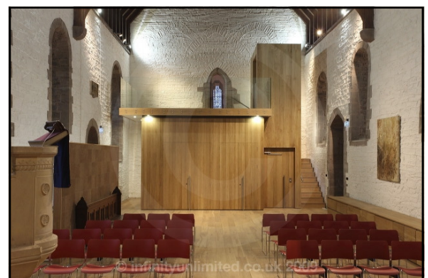
The facilities and lift inserted into the nave