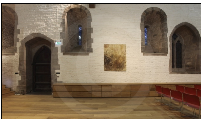
Ingeniously designed storage space in the nave