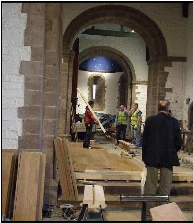
Work underway in St Peter's

EYES offered £250 k towards the cost of the refurbishment. In addition Advantage West Midlands offered £100 K from the Multi Use Facilities programme and several trust funds, including the Church Urban Fund, Church and Community Fund, offered funding towards the project. Herefordshire Council also offered funding from their Community Buildings programme and Cultural Services opened up discussions with regard to putting a permanent library facility in the church building, run and staffed by volunteers. This was incorporated into the plans and funded by them.