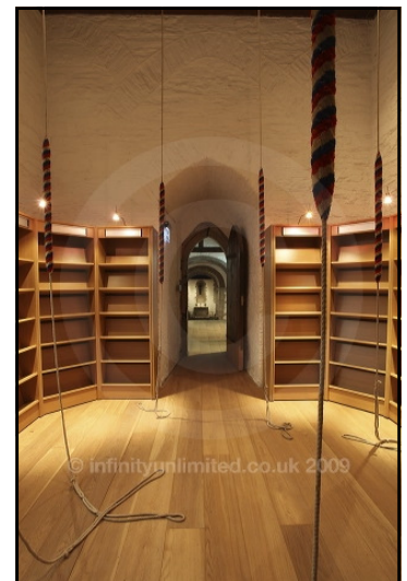
Library shelves in the bell tower

The project has met several objectives and addressed several needs of the Peterchurch Community: a long term use for an underused community facility and resource, ensured the sustainability of a major heritage building now in regular daily use, helped address the issue of access, increased service delivery from the church centre, created a greater sense of community cohesion and people working together to address their own needs, improved access to cultural activities through the facility provided in the Library and an improved performance space, and improved quality of life for families and young children.