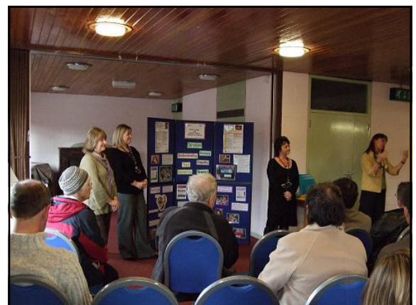
Members of the project team

A project team made up of the PCC, local authority officers, representatives from the wider community and the DAC was formed. The PCC held a public meeting and distributed a questionnaire to ascertain the level of support for the project and to examine other potential uses for the building. They were mindful that they did not want to compete with the existing community centre, and when forming the committee to develop the church project, they deliberately included representatives from the community centre on the project development group.