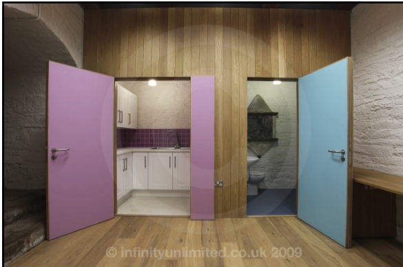
Kitchen and toilet facilities

With increasing confidence St Peter's are now looking for revenue funding for a youth worker and centre manager to help co-ordinate the activities in the church centre. The church development is part of a two phase project that will see the church complimenting the activities in the new community centre sited next door. The idea is to create a rural hub serving the people of the Golden Valley, providing a number of services currently only available in the nearest towns – 13miles in each direction.